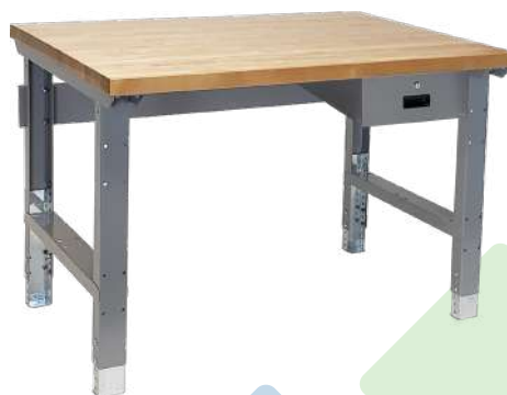
workbench with drawer