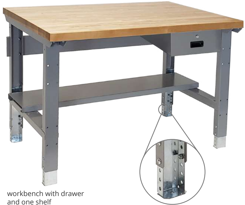
workbench with drawer and one shelf

Organize your tools and materials effortlessly with versatile accessories, including a convenient drawer, a half-depth shelf, back and end stops for secure storage, and a riser for enhanced workspace organization.