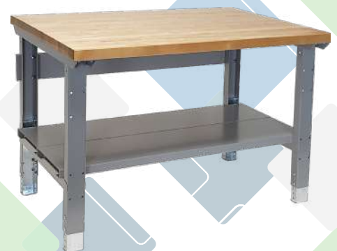
workbench with two shelves